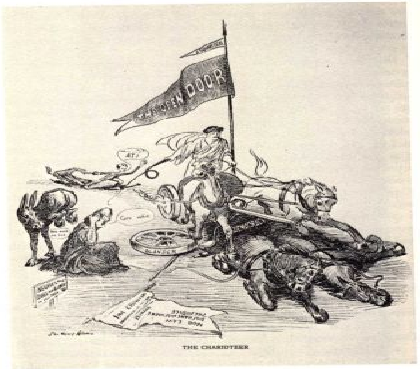
Political cartoon from the Voice of the Negro , December, 1904