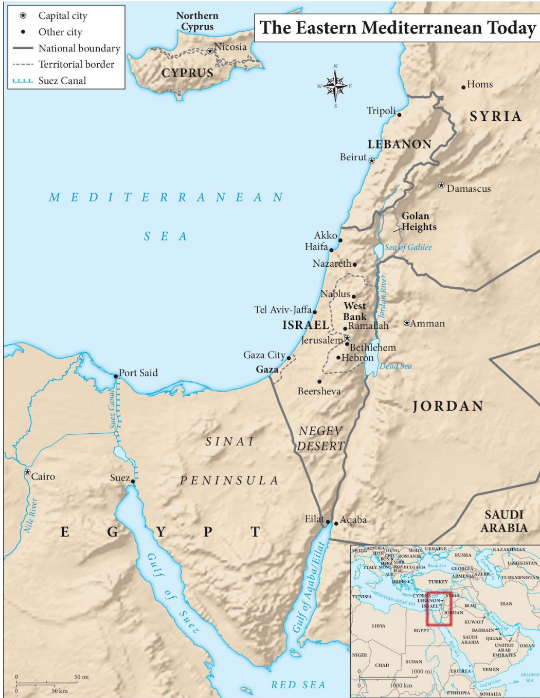
Figure 1: Map of the Middle East (Eastern Mediterranean) as of 2017 16