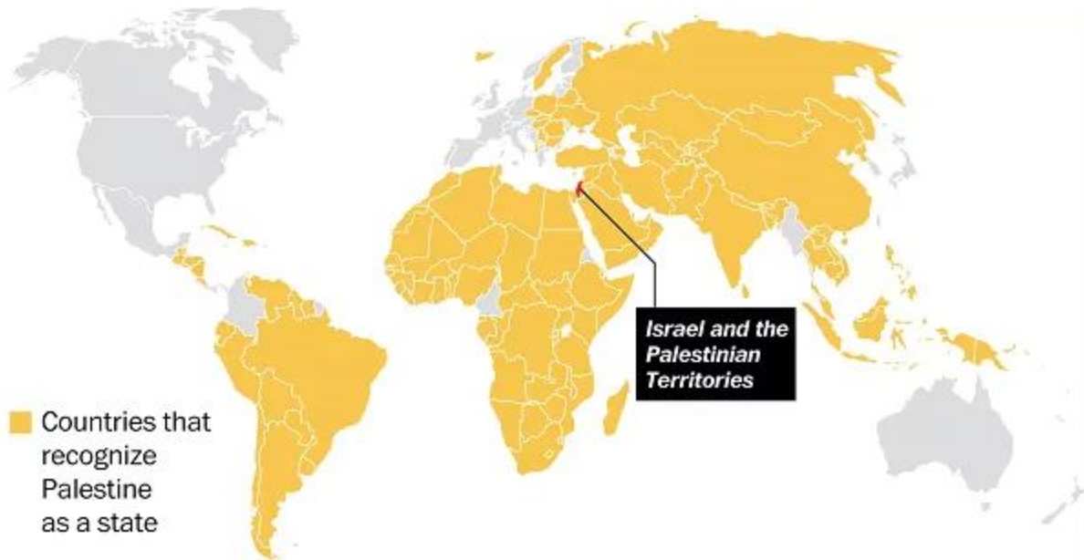
Figure 4: Countries Recognizing Palestine(November 2014) 19