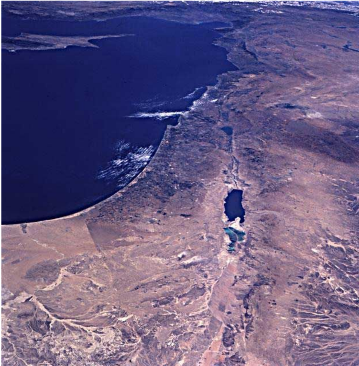
Figure 2: Satellite Map of Israel 17