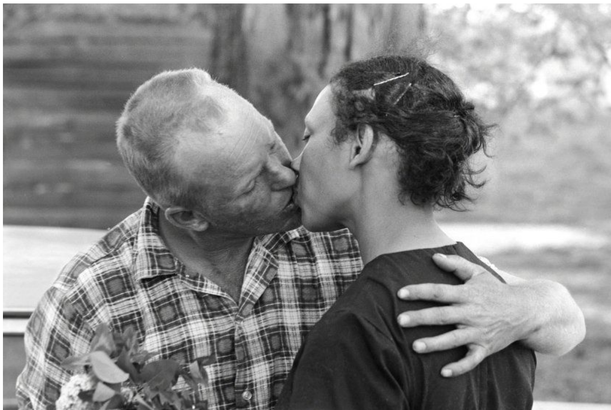
Richard and Mildred Loving. 18 Mar. 1966.

This photo shows Richard Loving, left, and Mildred Jeter, right, showing their affection and love for each other.