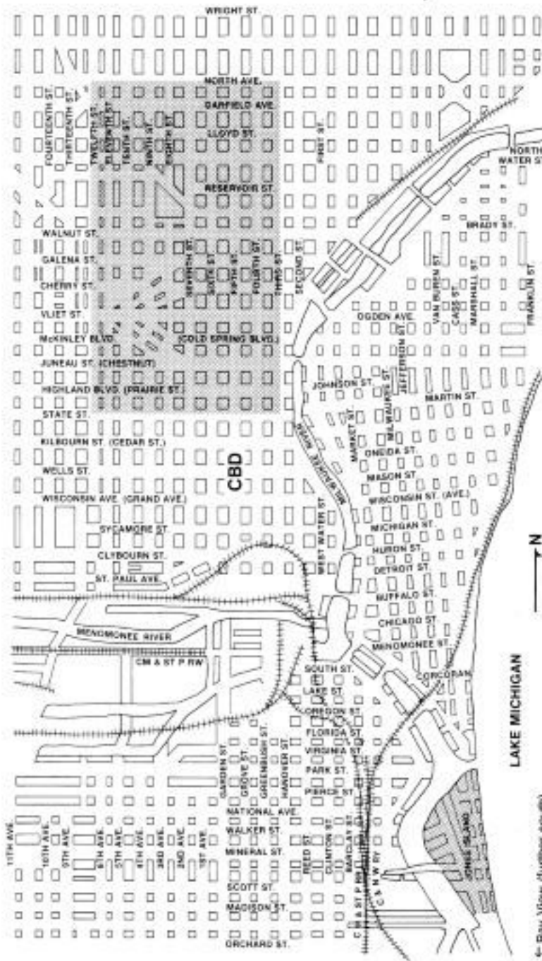
Map 2.2. Milwaukee's Black District, 1932